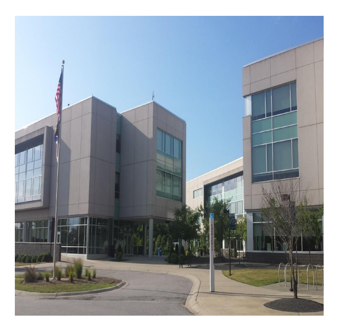
Scott Northern Wake Campus